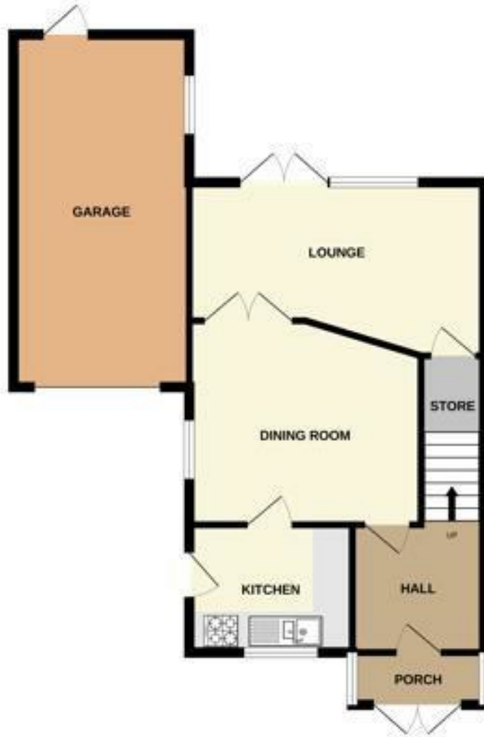
GROUND FLOOR 602 sq ft. (55.8 sq m.) approx.